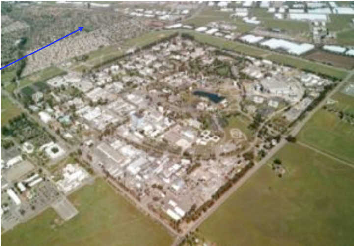
Lawrence Livermore National Laboratory is located off Vasco Road, near Interstate-580, in Livermore, California, about 48 miles East of San Francisco (aerial view above). Site 300, a ten-square-mile remote explosive/experiment testing site, is situated 18 miles to the east. Lawrence Livermore has an annual budget of about $1.6 billion and a staff of over 8,000 University of California employees.